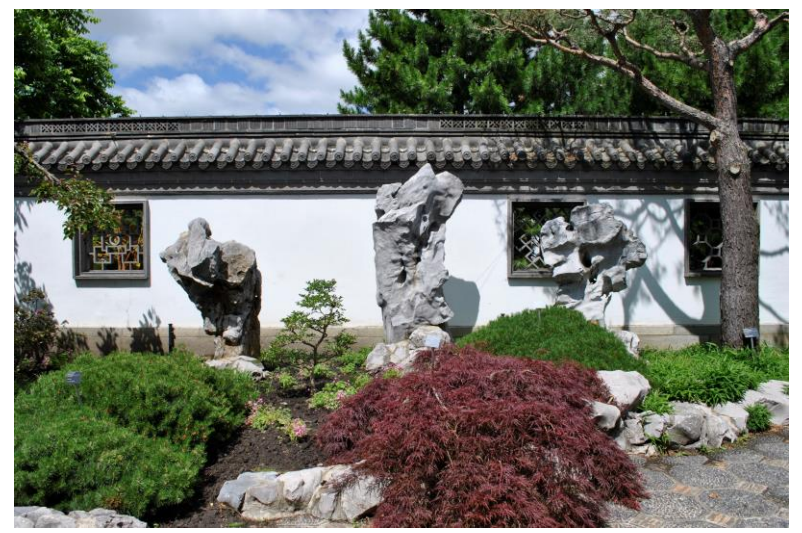
Fig. 4 Chinese garden in Montreal: Note eccentric rocks; window lattice patterns and tile roof.